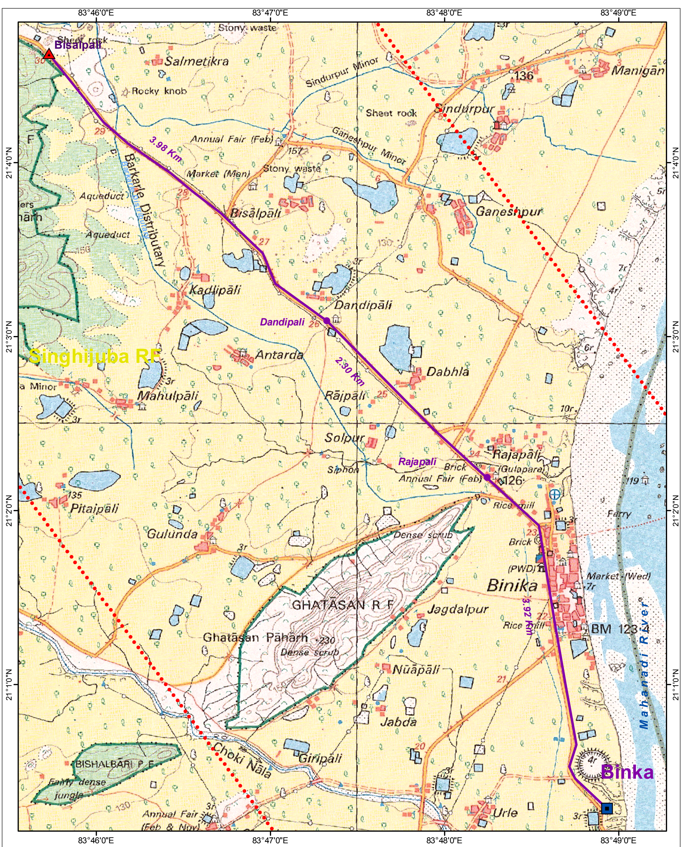
Plate : SON 1b